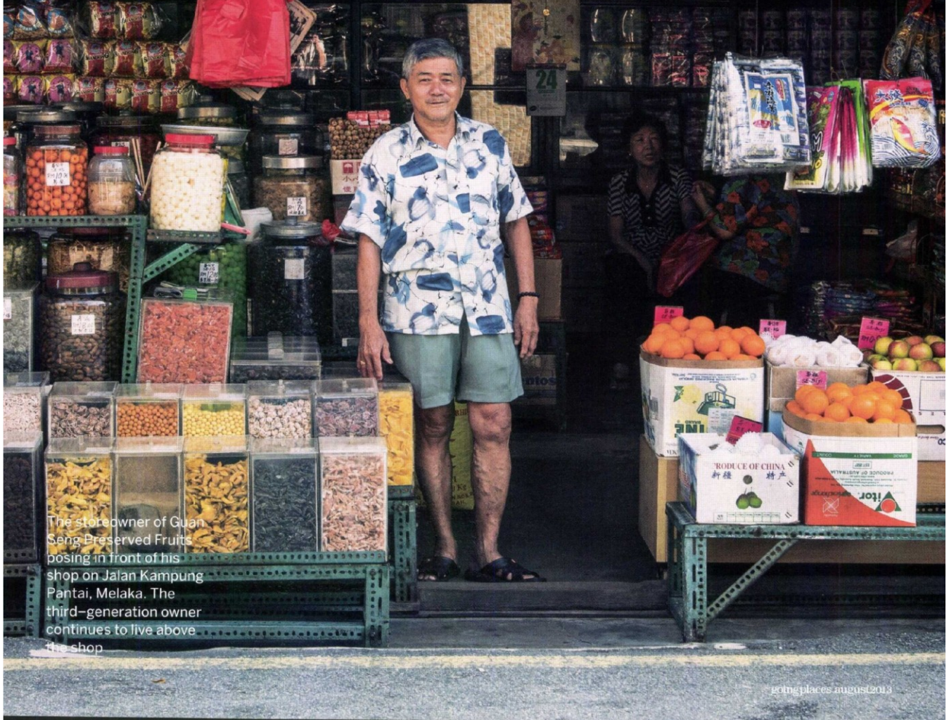
The storeowner of Guan Seng Preserved Fruits posing in front of his shop on Jalan Kampung Pantai, Melaka. The third-generation owner continues to live above the shop