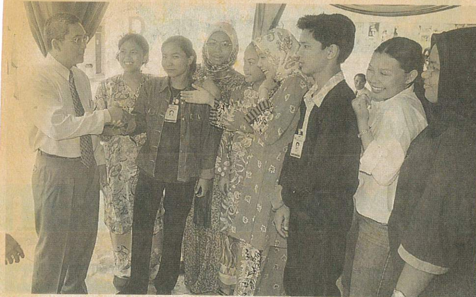
TAHNIAH... Sukarno bersalam dengan pelajar baru ASK