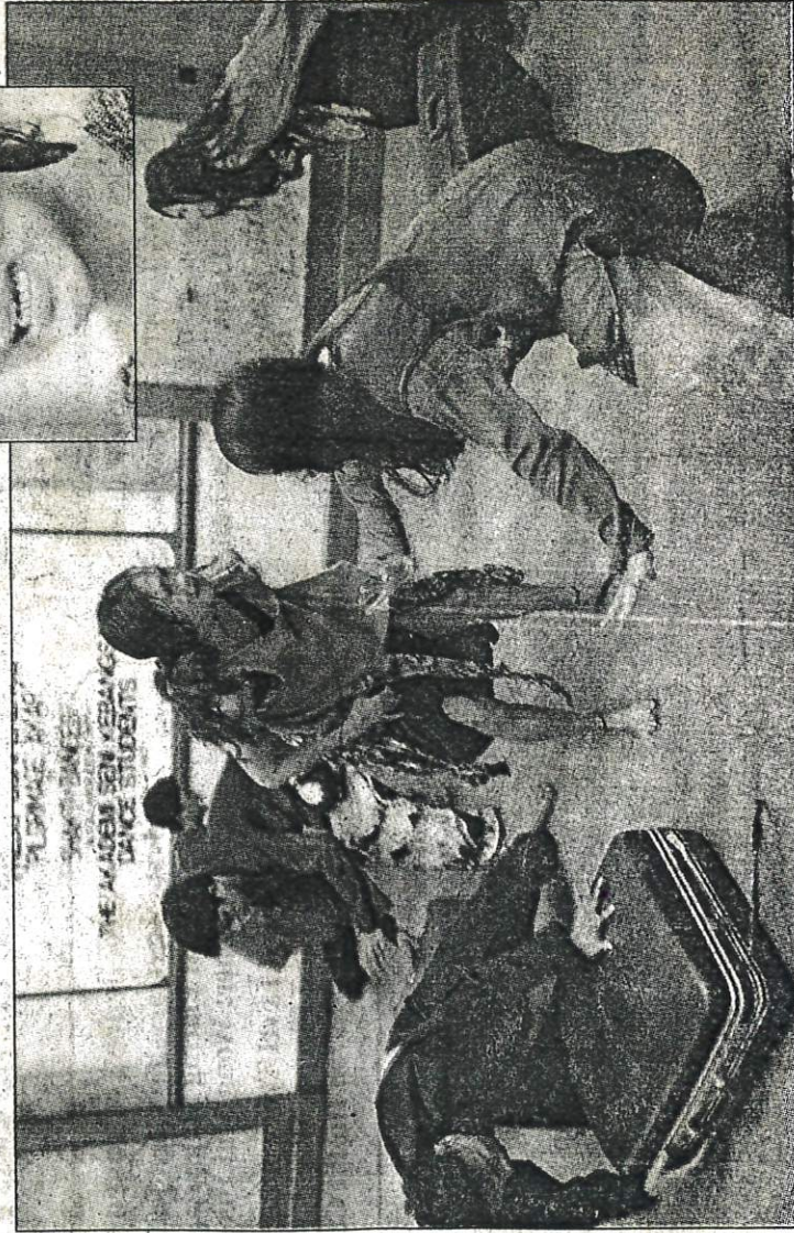
A scene at the 'airport' where people from all walks of life converge on.

The show will be staged on July 11, 12, 18, 19, 25 and 26. Tickets for the show are priced at RM35++ inclusive of one drink. For reservations, call 552-2200 ext 2121.