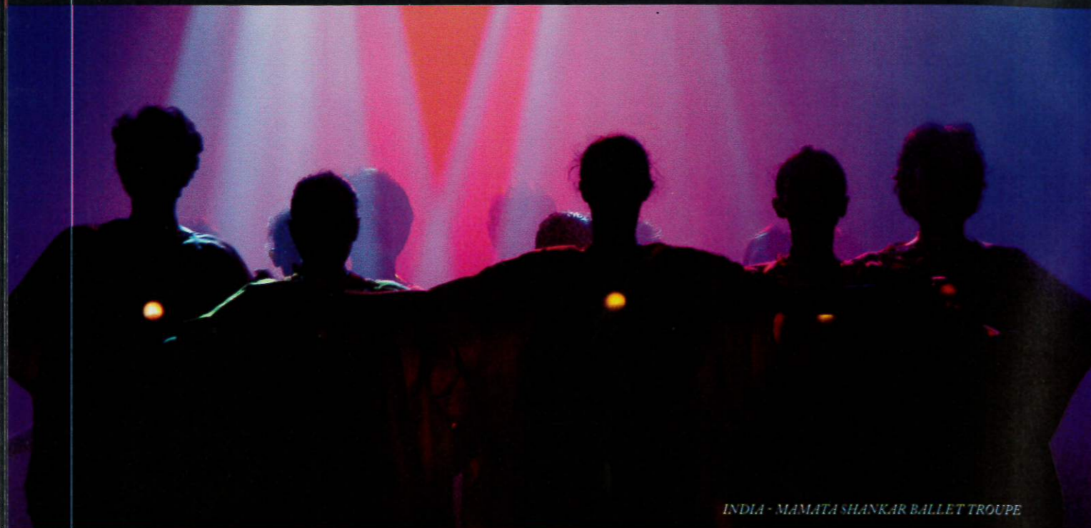
INDIA - MAMATA SHANKAR BALLET TROUPE