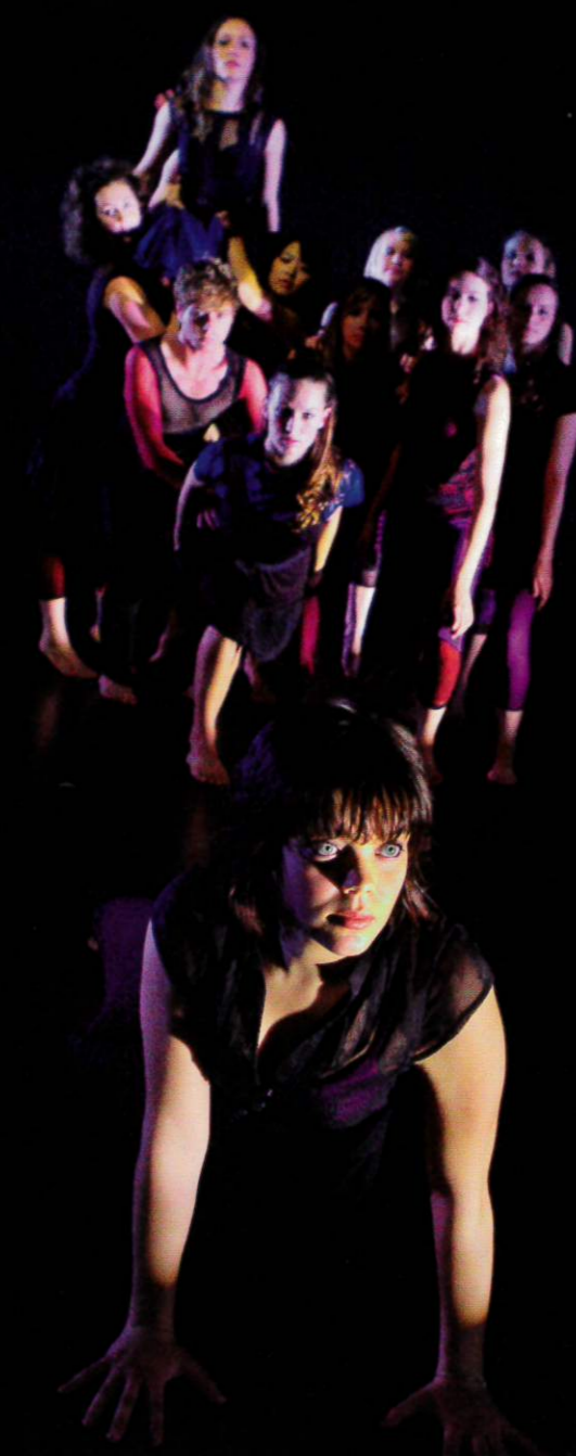
AUSTRALIA - EDITH COWAN UNIVERSITY

The standard of arts education in Malaysia needs to be on par with that of other international institutions. In 2007, the Ministry of Education launched 2 new arts secondary schools in Johore and Sarawak. Through TARI 07, it is hoped that useful dialogue and exchange of knowledge can take place to further improve standards of teaching, research and performance.