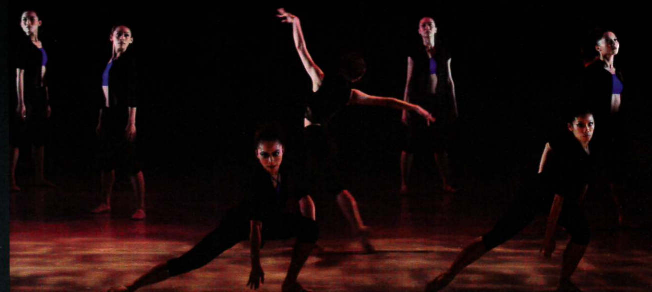
TAIWAN - CHINESE CULTURE UNIVERSITY