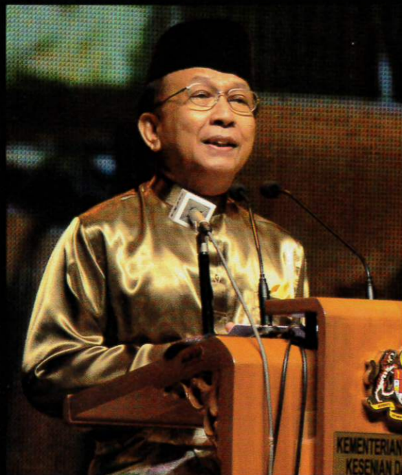
YB Datuk Seri Utama Dr. Rais Yatim Menteri, Kebudayaan, Kesenian dan Warisan Malaysia Minister of Culture, Arts and Heritage Malaysia