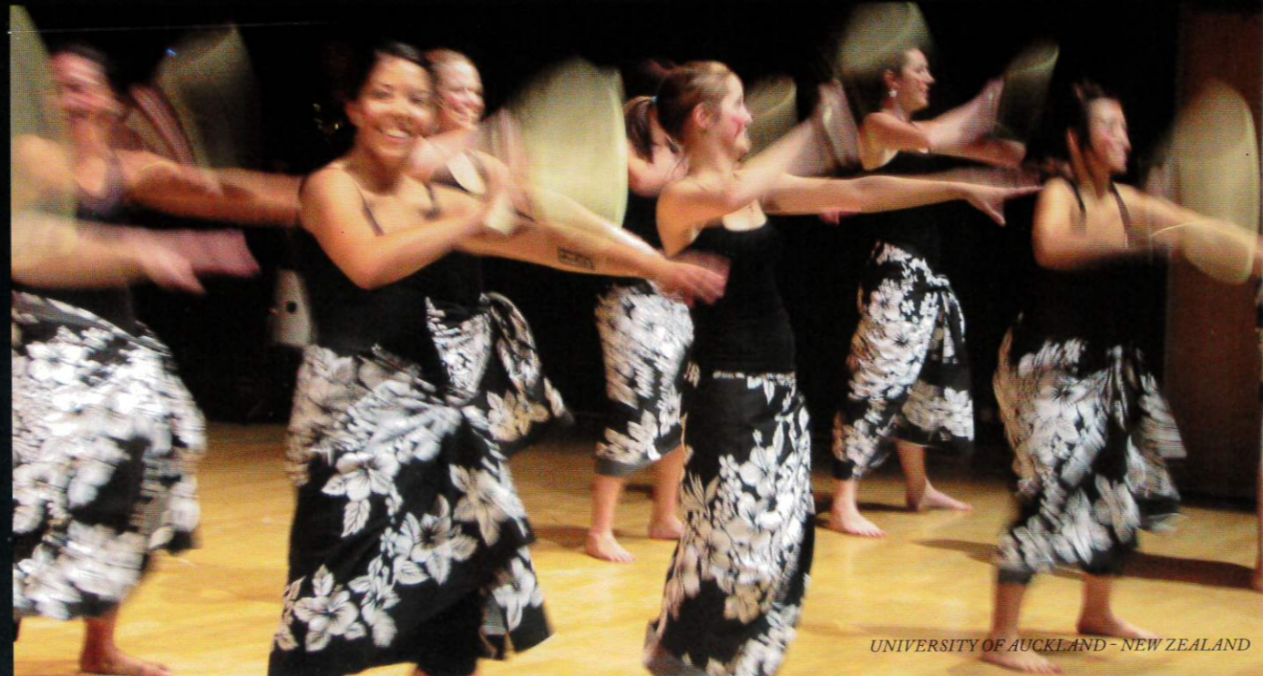
UNIVERSITY OF AUCKLAND - NEW ZEALAND

by Hon. Deputy Minister of Culture Arts and Heritage, Malaysia